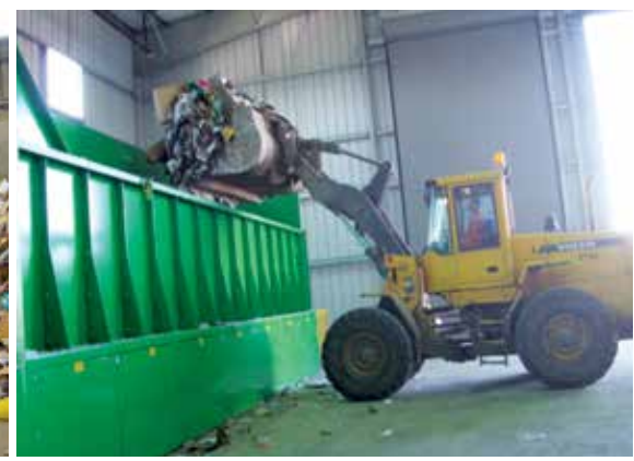
METERING BIN: This machine evenly meters the amount of recycling entering the facility.