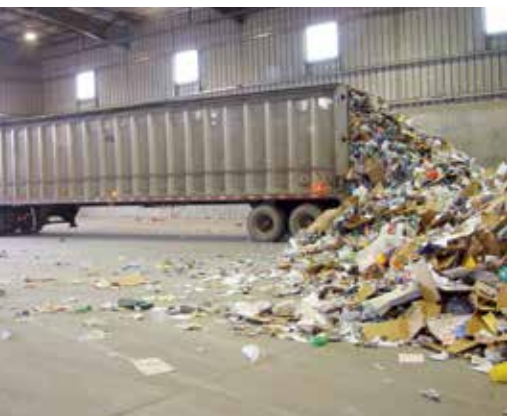
TIP FLOOR: The trucks empty recyclables onto the tipping floor.